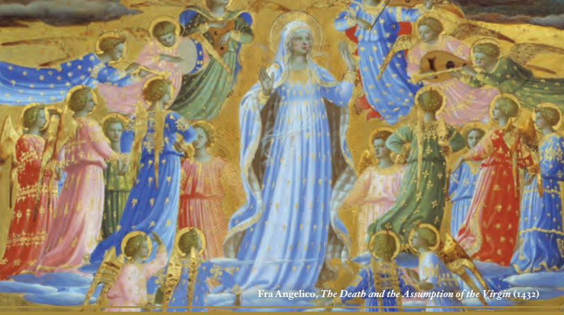
Fra Angelico, The Death and the Assumption of the Virgin (1432)