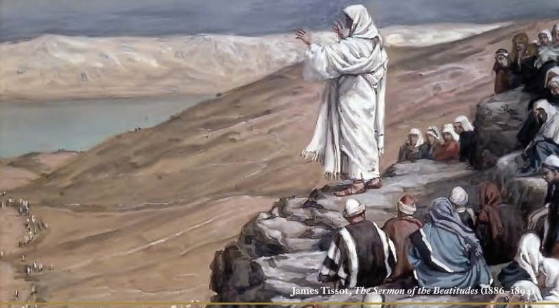
James Tissot, The Sermon of the Beatitudes (1886-1894)