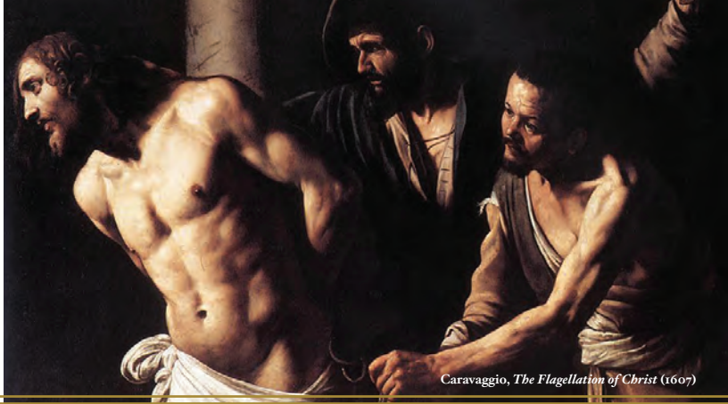
Caravaggio, The Flagellation of Christ (1607)