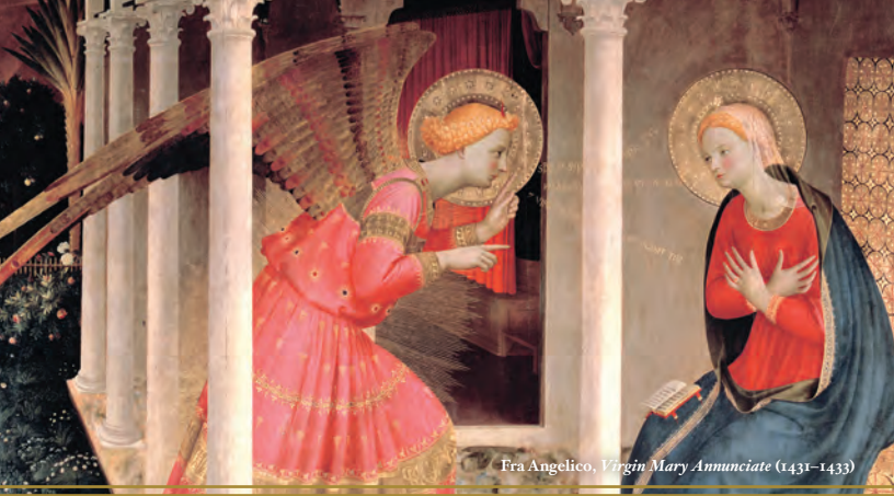
Fra Angelico, Virgin Mary Annunciate (1431–1433)