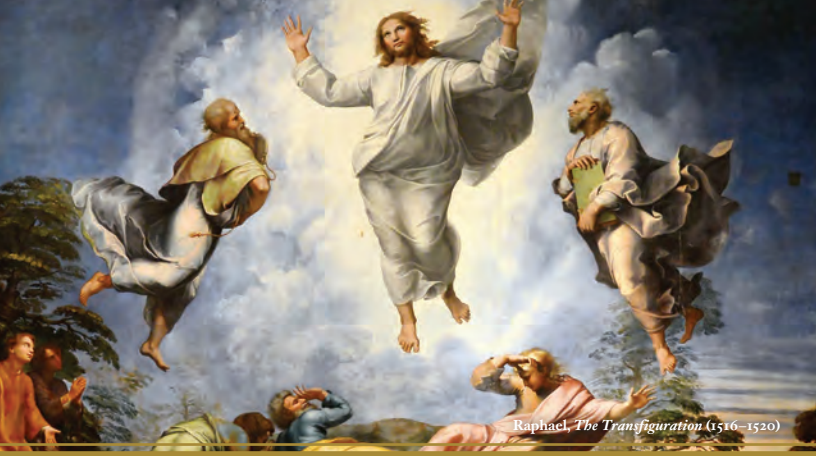
Raphael, The Transfiguration (1516–1520)