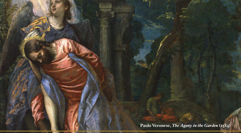
Paolo Veronese, The Agony in the Garden (1584)