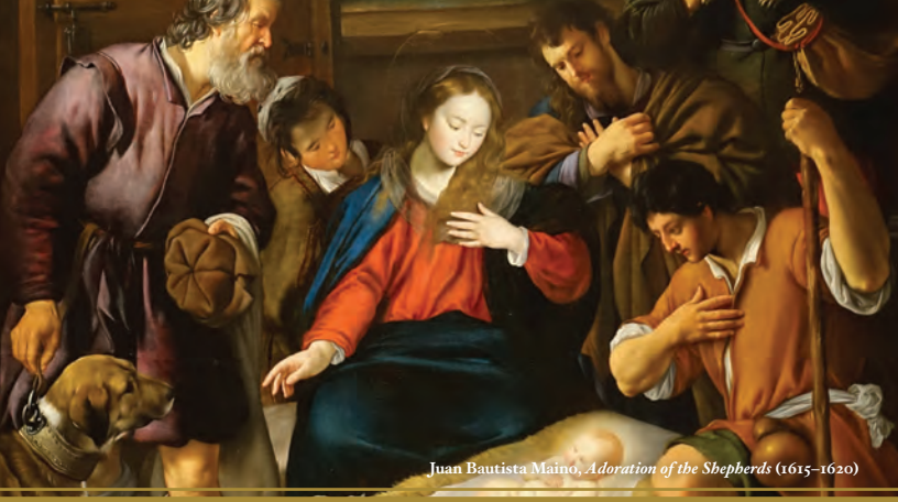
Juan Bautista Maino, Adoration of the Shepherds (1615–1620)