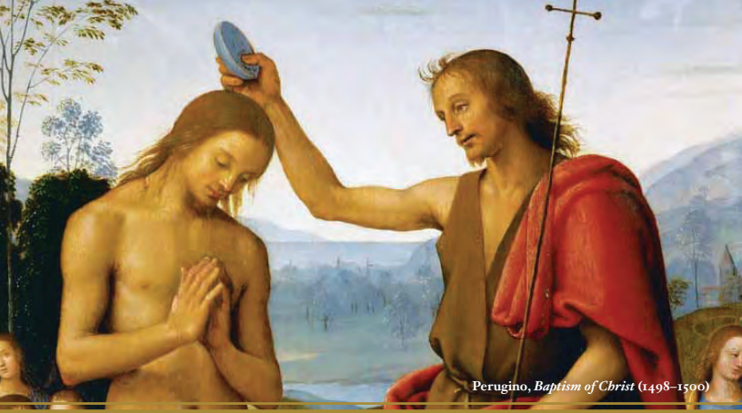
Perugino, Baptism of Christ (1498–1500)