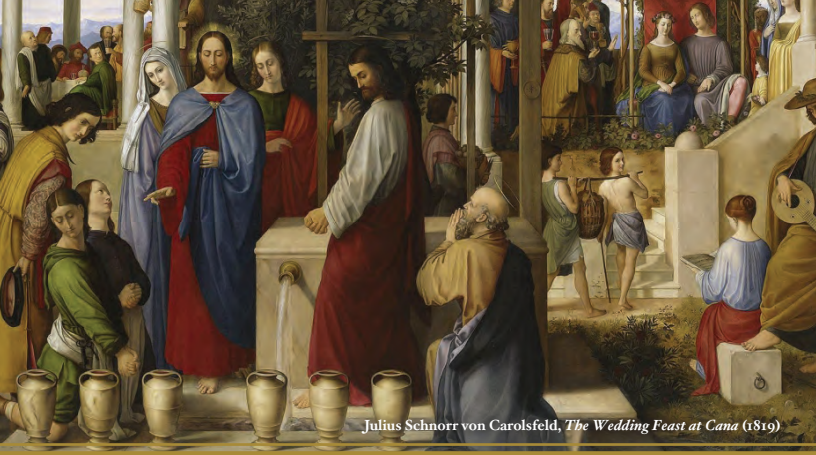
Julius Schnorr von Carolsfeld, The Wedding Feast at Cana (1819)