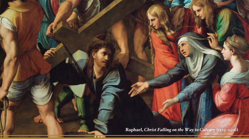
Raphael, Christ Falling on the Way to Calvary (1515–1516)