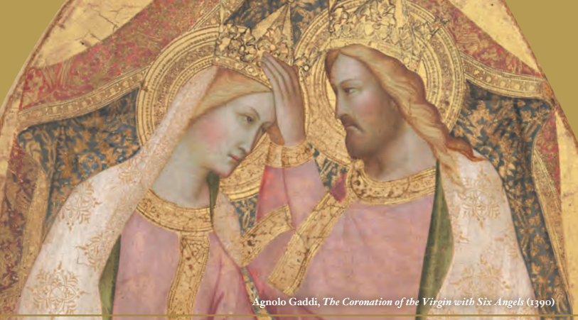
Agnolo Gaddi, The Coronation of the Virgin with Six Angels (1390)