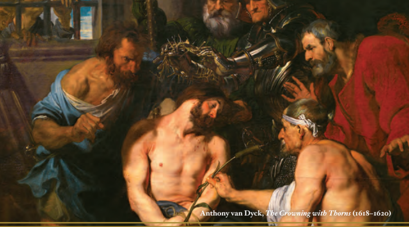
Anthony van Dyck, The Crowning with Thorns (1618–1620)