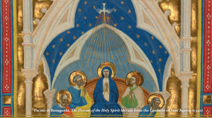
Pacino di Bonaguida, The Descent of the Holy Spirit (detail) from the Laudario of Sant'Agnese (1340)