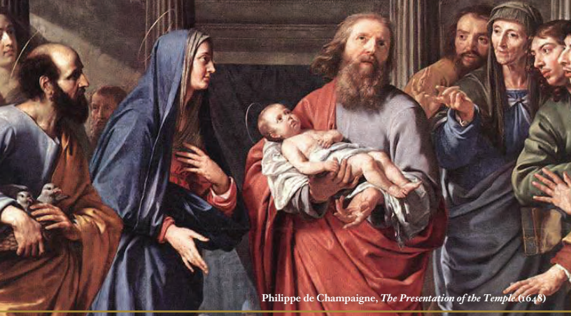
Philippe de Champaigne, The Presentation of the Temple (1648)