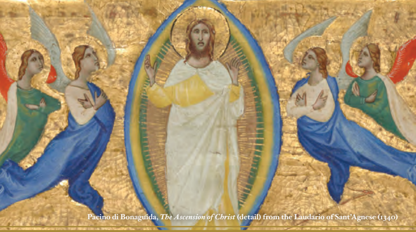
Pacino di Bonaguida, The Ascension of Christ (detail) from the Laudario of Sant'Agnese (1340)