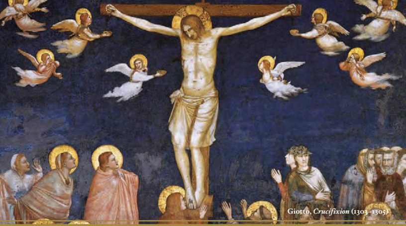
Giotto, Crucifixion (1303-1305)