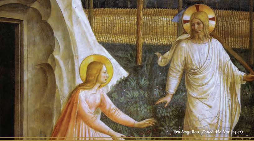
Era Angelico, Touch Me Not (1442)