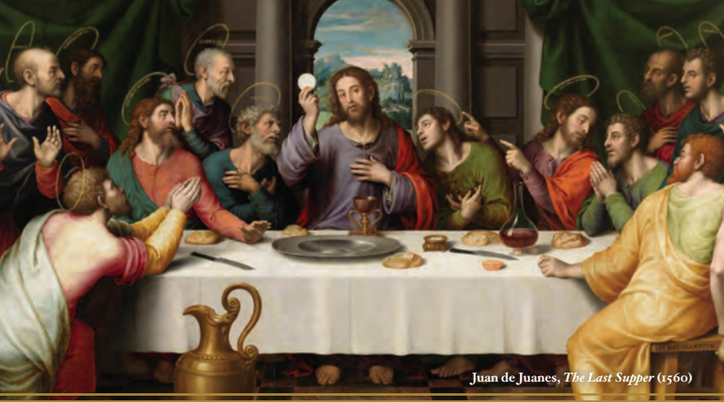
Juan de Juanes, The Last Supper (1560)