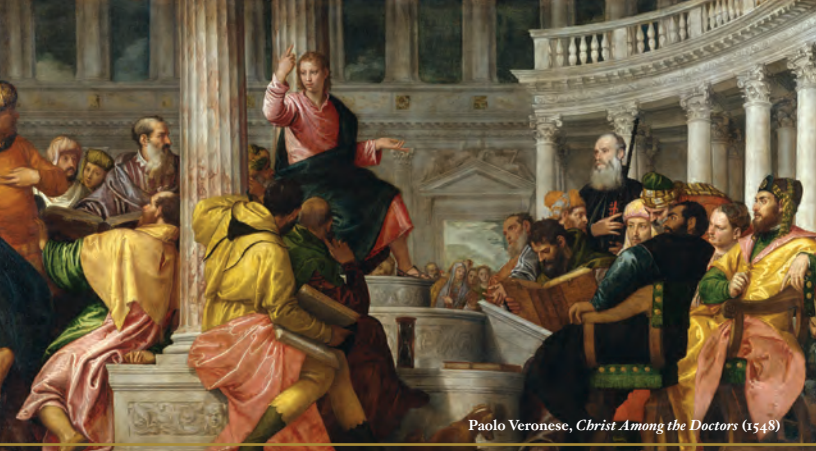
Paolo Veronese, Christ Among the Doctors (1548)